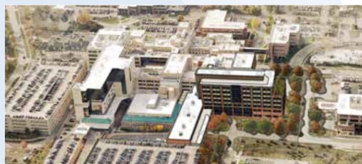
Family Birth and Children's Center at Munson Medical Center.