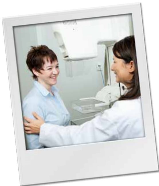
A generous donation provided for leading-edge mammography equipment at Charlevoix Hospital.

Recently, Munson Healthcare launched the new Simply Amazing campaign which focuses on helping those we serve get back to doing what they love.