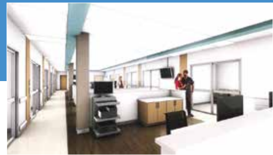
Expansion and renovation of the emergency department, surgery, and ambulatory care space continues at Otsego Memorial Hospital.

As a nonprofit, everything we earn goes back into our organization — toward projects and initiatives that help keep our hospitals and facilities strong. And thanks to generous gifts from community members throughout our health care system, we're able to enhance our facilities and services in a number of ways. Here are some updates from around our health care system: